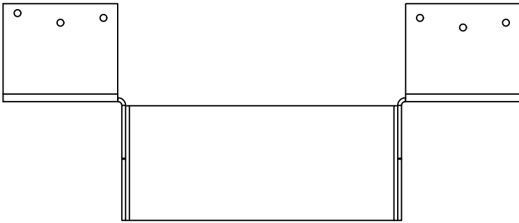
BPHA7118 - TOP VIEW